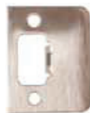
DL-TA020 1 1/4" x 2 1/4" Full Lip Strike