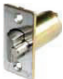
DL-DLUL238 2 3/8" DL-DLUL234 2 3/4" Backset Deadlatch