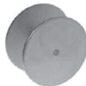
DL-DX161 FILLER COVER • 2 3/8" filler plate • Finishes: USP, US26D